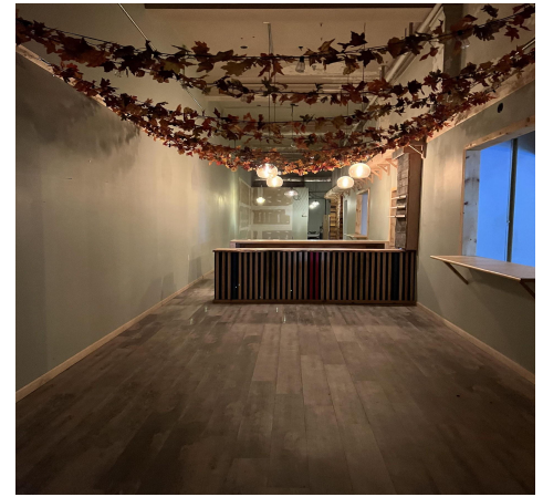
Eating / Entertainment Area