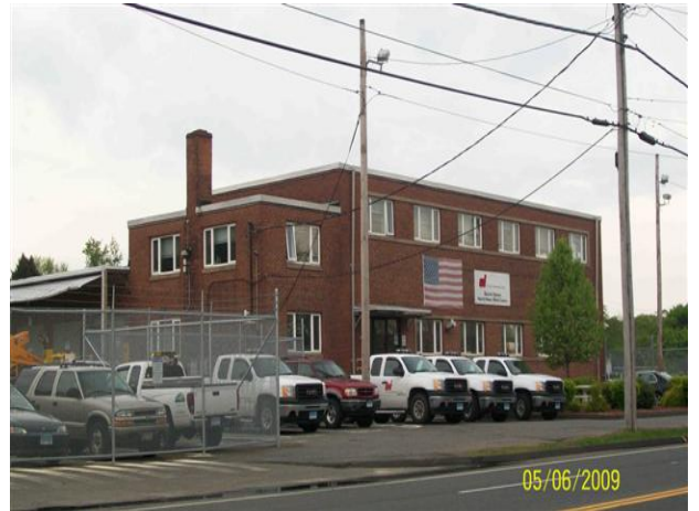
( http://images.vgsi.com/photos/NorthHavenCTPhotos/\00\01\00\15.jpg )